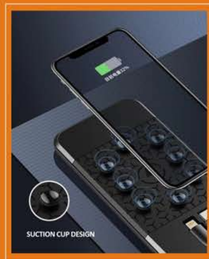
SUCTION CUP DESIGN

Model(型号): K-628 Capacity(容量): 10000mAh Battery(电池): Polymer lithium ion battery(聚合物锂电池) Input(输入): Micro/Type-C: DC5V/2.1A Output(输出): USB/Micro/Type-C/Lightning: DC5V/2.1A Indicator(电量指示): 4 LED Lights(指示灯) Size(尺寸): 148*70*16mm Weight(净重): 230g Material(材质): ABS + PC Plastic(ABS+PC防火料) Color(颜色): Black, White